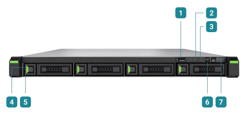
Figure 2-1 System Controls and Indicators

The XCubeNAS series features a unique design: the system controls and indicators are located on the right ear. The system controls and indicators module integrates functional buttons and system state indicators, which can be easily operated and read by user.